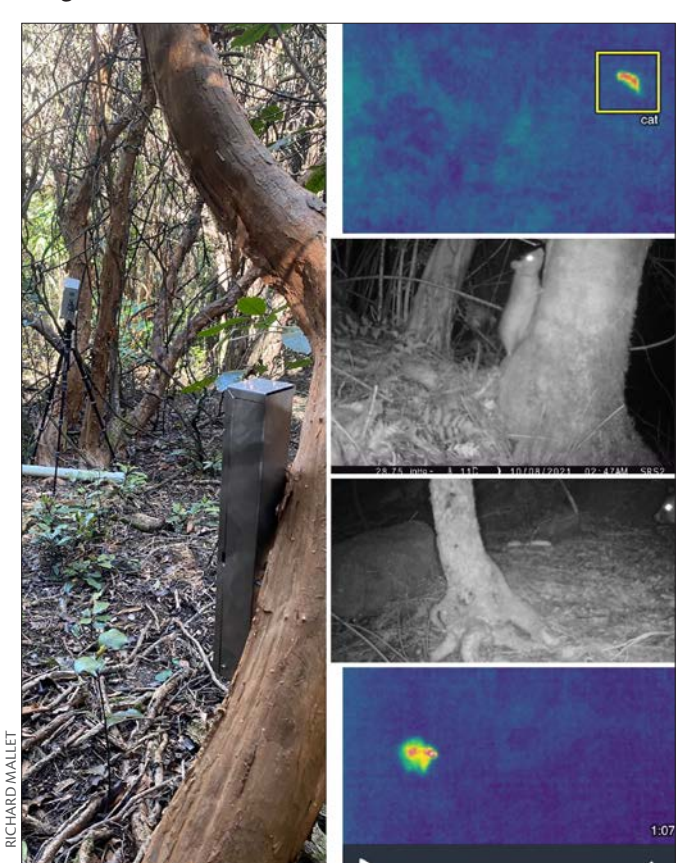
Camera monitoring at Omahu Bush.

Ohinetahi and Omahu are important bush areas in Te Kākahu Kahukura, a large-scale collaboration led by the Banks Peninsula Conservation Trust to restore and connect 1000ha of native bush on the southern Port Hills. Pest Free Banks Peninsula is supporting a wider programme of work to suppress predator populations in Te Kākahu Kahukura in order to aid restoration efforts and provide safe habitat for native birds, lizards and insects.