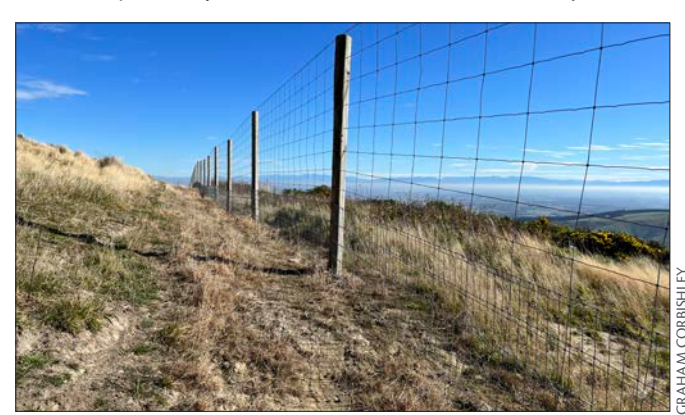
The perimeter deer fence at Omahu Bush

The fence has created a new maintenance workload and a simple manual is being prepared with a database map that will outline regimes for regular inspection and maintenance. Maintaining vegetation suppression and checking culverts and creek crossings adjacent to the fence are examples of ongoing workload. The fencing contractor has completed some enhancement work to install a layer of equine mesh around the base of the perimeter