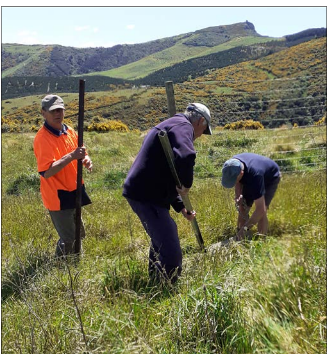
Volunteers removing redundant fences at Omahu.