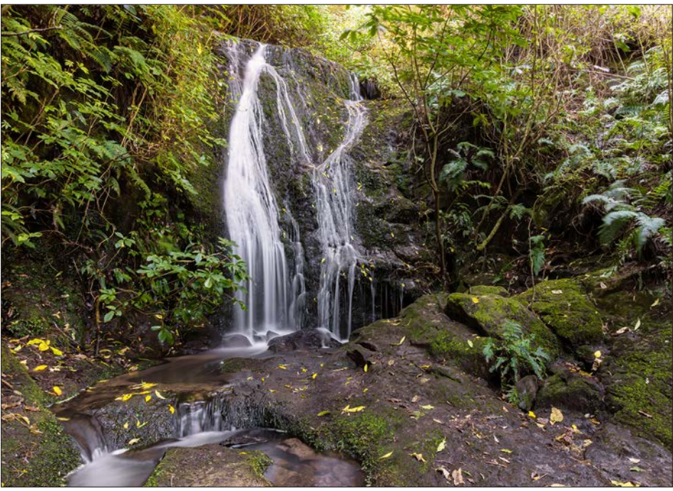
The magical Anne's Falls.