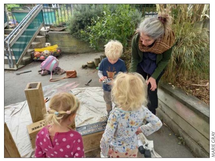
Building traps with the kids at Lyttelton Kindy.