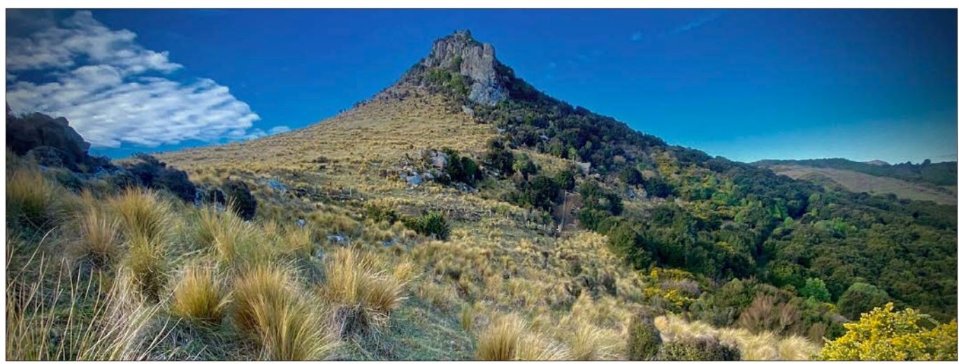
The trap network is extending to Gibraltar Rock and the grazing block.