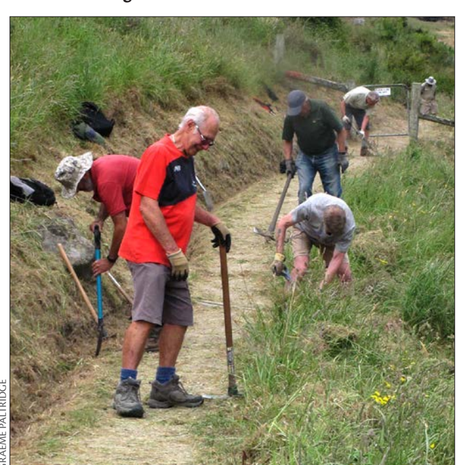
The Eastenders undertaking maintenance on the Eastenders Track.