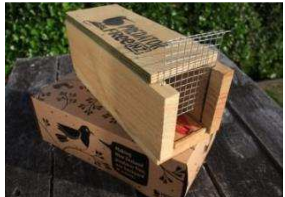
We'd like to make wooden tunnels similar to these

in touch via email, or keep an eye on the PFPH Facebook page for updates.