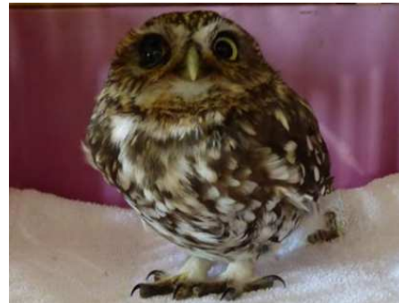
A Little Owl with an eye injury in the care of Canterbury Raptor Rescue

Phone 021 292 7861 or email obr@xtra.co.nz . Also, known as Oxford Bird Rescue, they have a website and Facebook page www.oxfordbirdrescue.org.nz .