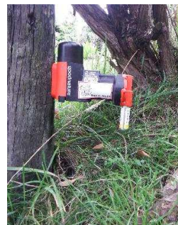
A Goodnature A24 rat trap, ready to catch rats