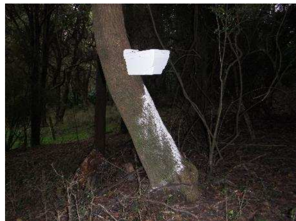
Trapinator possum trap on a sloping tree with flour-icing sugar-cinnamon blaze of lure below, in addition to the bait in the trap

Also, unlike rats, possums are curious. They will be attracted to bright and novel things. In addition to a nice white Trapinator box, you can use lure on the tree below the trap to entice them towards the trap. It's best to use lures that aren't attractive to other animals – a mixture of flour, icing sugar, and a spice like cinnamon is good for this.