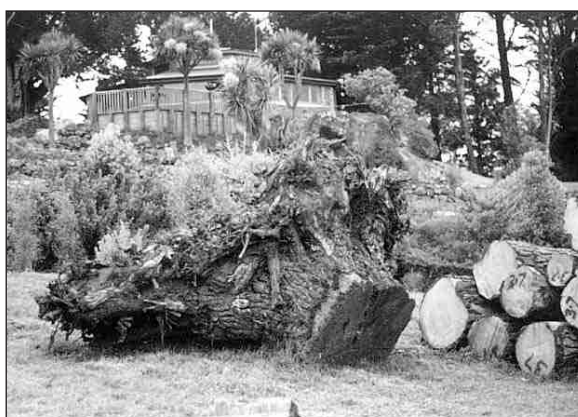
Victoria Park. Clean up of the old trees that succumbed to the October 2000 storm.

The P. radiata forest in Bowenvale was completely destroyed and had to be logged. At this stage we have completed the extraction of the lower section of plantation and the site has been re-