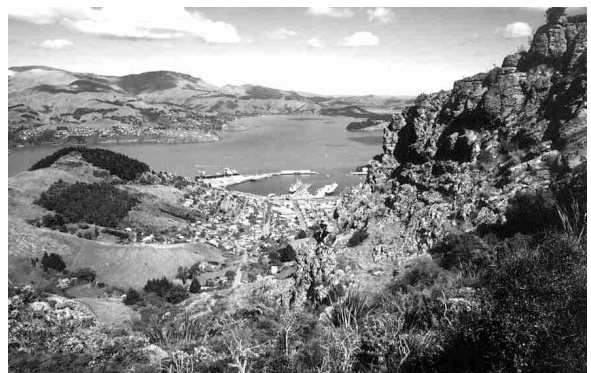
An interesting view of Lyttelton from the Mt Pleasant Bluffs Track during the September 2001 Outing.