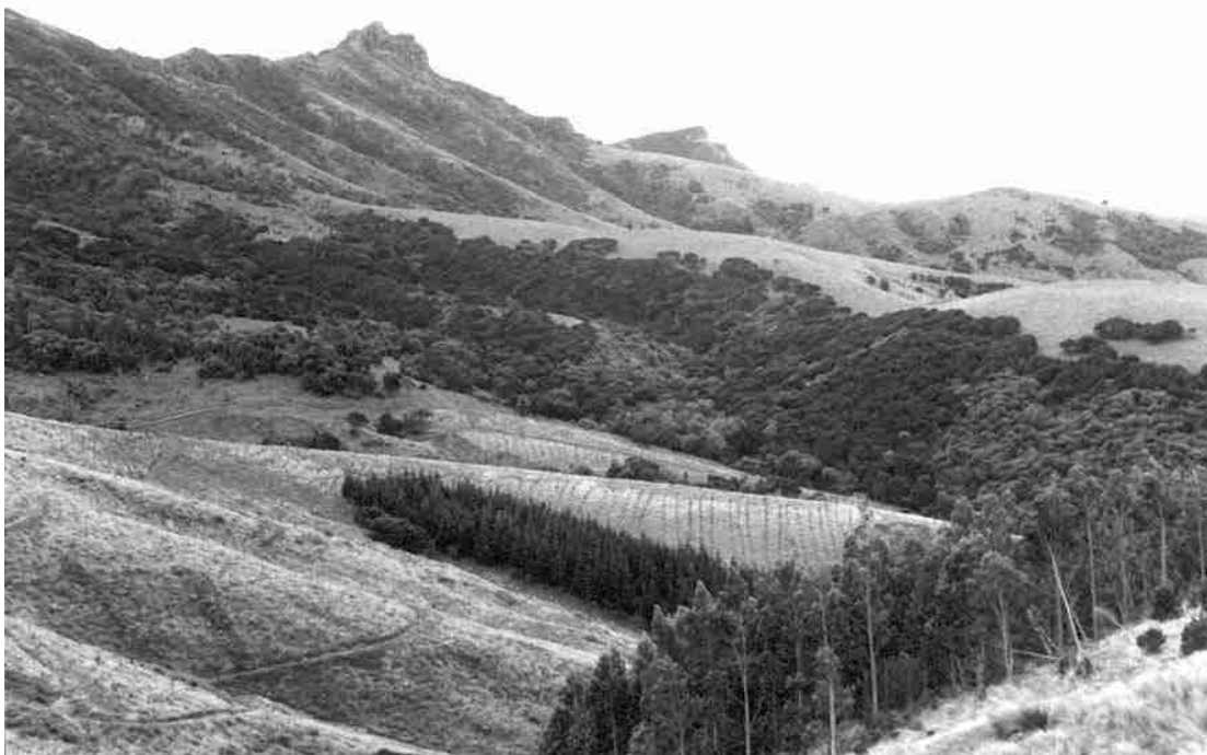
Coopers Knob from Conical Hill on the south Summit Road.