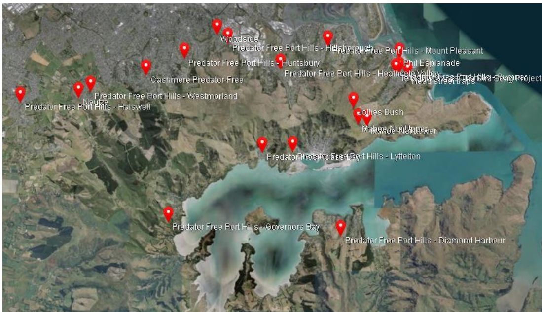
Predator Free Port Hills groups on TrapNZ ( https://www.trap.nz )