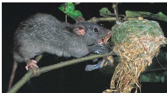
Rat eating a bird from a nest

PFFPH is important. The Port Hills and surrounding suburbs have great potential for flourishing biodiversity in their own right, and long term they will form a buffer to a Predator Free Banks Peninsula.