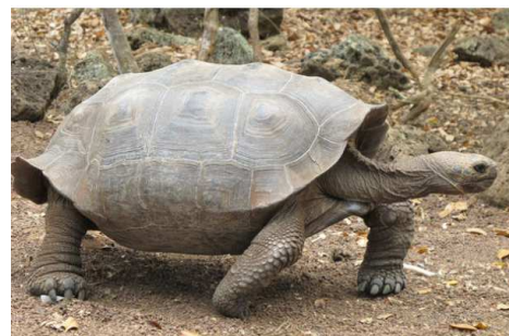
An adult tortoise

Most of us think of the Galapagos Islands as a biodiversity hotspot, but did you know that it's only recently that baby tortoises have been seen. This is after more than 100 years without any baby tortoise sightings in the wild. This has only happened after rats were eradicated from Pinzon Island, one of the islands in the Galapagos.